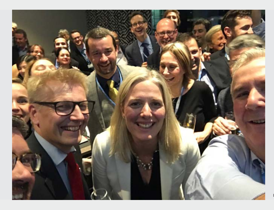
IETA's 'Ellen at the Oscars' moment as the AGM closed

Climatiques (MDDELCC) Quebec; Organisation For Economic Co-Operation And Development (OECD); Pacific Gas and Electric Company (PG&E); Statoil; TRI; World Bank Group and YC Consultants.