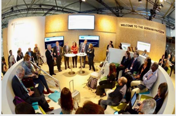
Innovate4Climate launch at the German Pavillion

On the <u>Climate Technology Centre and</u> <u>Network</u> (CTCN), the COP renewed its agreement with UNEP to host the facility for a further four years. However, it also flagged concerns about long-term sustainable financial support for the CTCN, and reminded