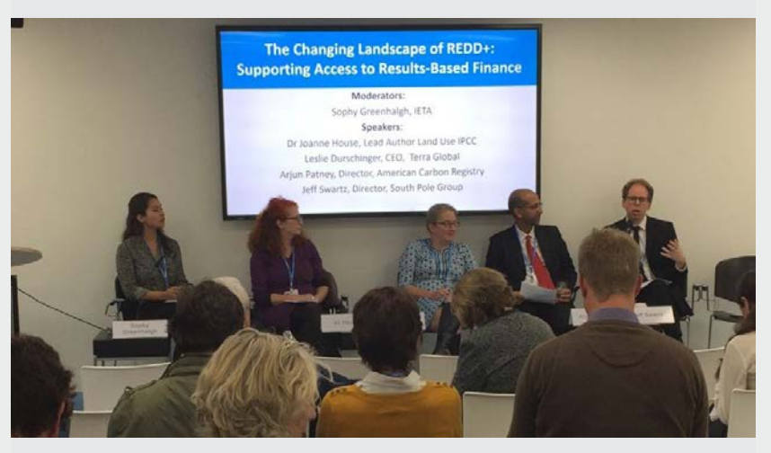
Although REDD+ was not on the official COP23 agenda, it was heavily discussed at many side events, including this session in week 1 at the IETA Business Hub