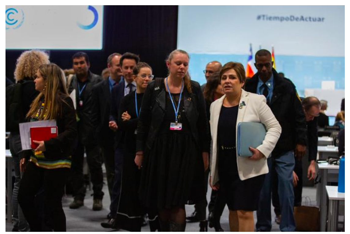
COP25 ended at 1:55pm on Sunday afternoon, making it the longest-ever meeting

In their closing statements, several Parties affirmed that the impossibility of finding agreement on the Article 6 rules will not stop international markets cooperation from moving ahead – while also noting that they intend to use the latest version of the Article 6.2 text as a basis to move forward with Article 6 pilots.