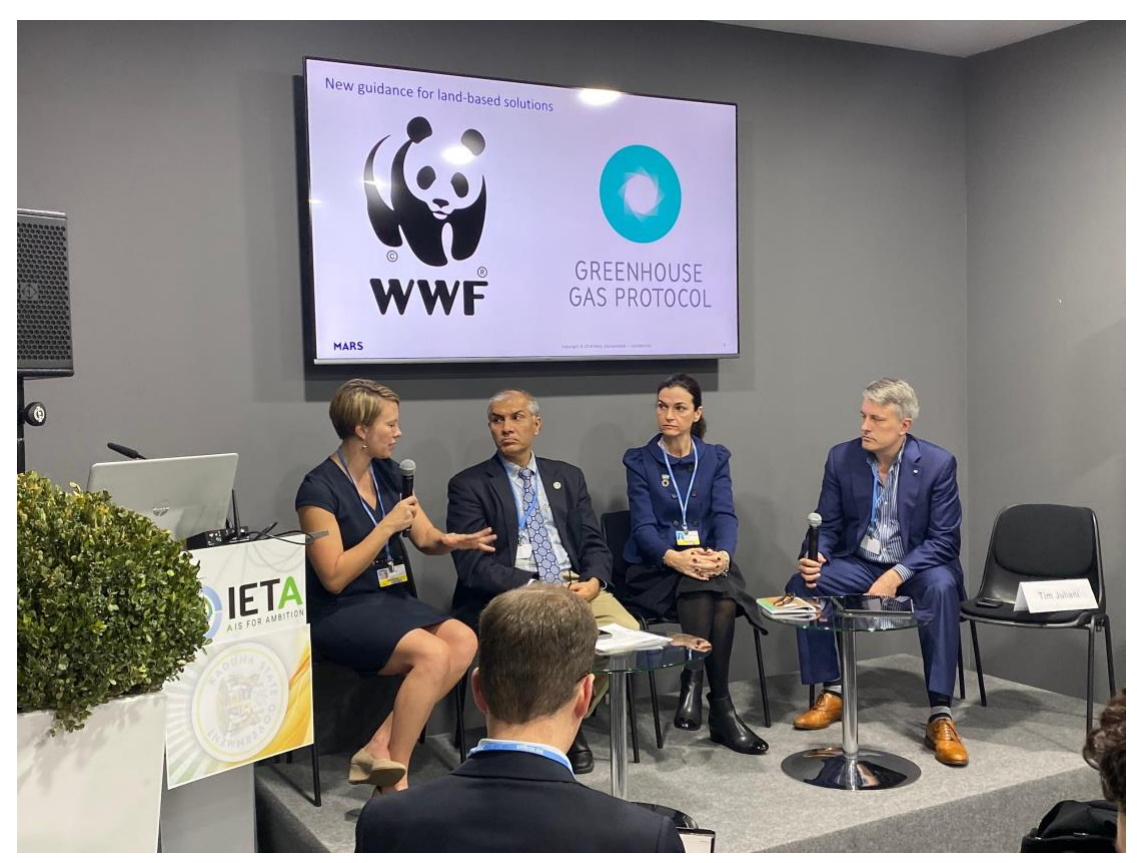
Hub Partners Mars hosted two sessions on land use, agriculture and forest protection

A proposed SBSTA meeting on Saturday night was cancelled, since few had had an opportunity to study the new text. Negotiators gathered privately on Sunday to focus on the divisive issues.