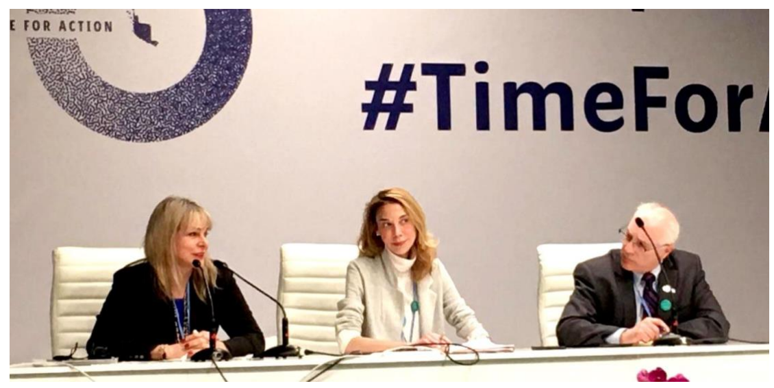
IETA staff were active participants in the daily BINGO briefings.

On Tuesday 10 December, the political phase kicked into high gear. The Presidency circulated the SBSTA texts among Parties and asked the climate ministers of New Zealand (James Shaw) and South Africa (Barbara Creecy) to facilitate discussions at ministerial level. Parties were encouraged to focus on where convergence could be found, including drafting compromise proposals, rather than adding new options.