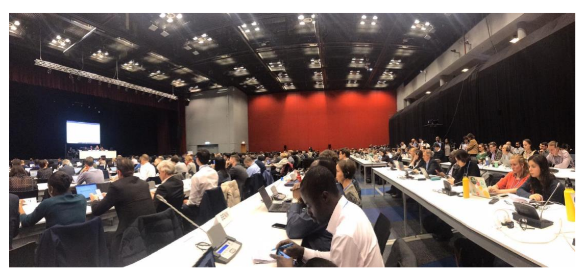
Article 6 negotiations at this year's COP enjoyed far greater participation from Parties and observers than they have at previous events.

The complete list of documents and decisions adopted at COP25 can be found here.