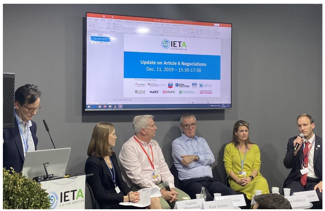
IETA organised regular sessions providing insights into the progress of the talks.

With Article 6 dominating the agenda at this COP, IETA was in a prime position to showcase our members' and staff's expertise. Throughout the two weeks we hosted side events at which experts provided updates on the state of the talks, while IETA staff appeared at a wide variety of events elsewhere in the halls.