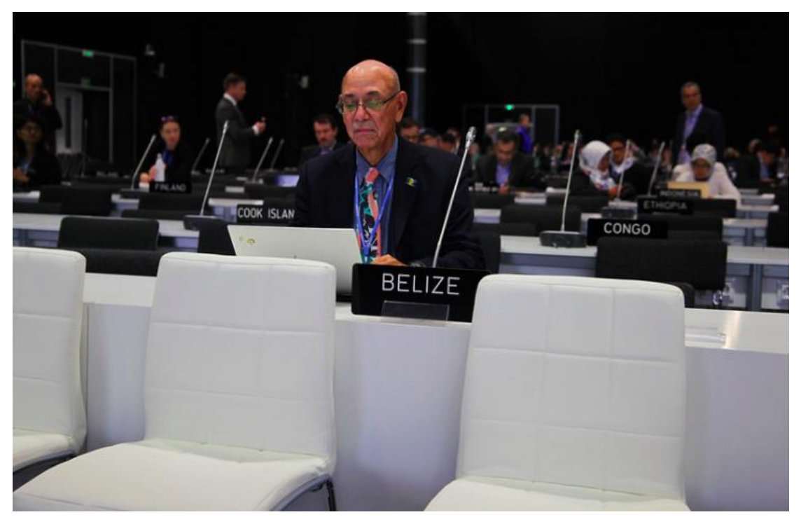
Belize led the AOSIS group at COP25 and pressed hard for a more ambitious outcome.

Another event by the Asia Society Policy Institute reviewed latest developments in efforts to link carbon markets in Asia, featuring speakers from Korea, Thailand, the Asian Development Bank and New Zealand.