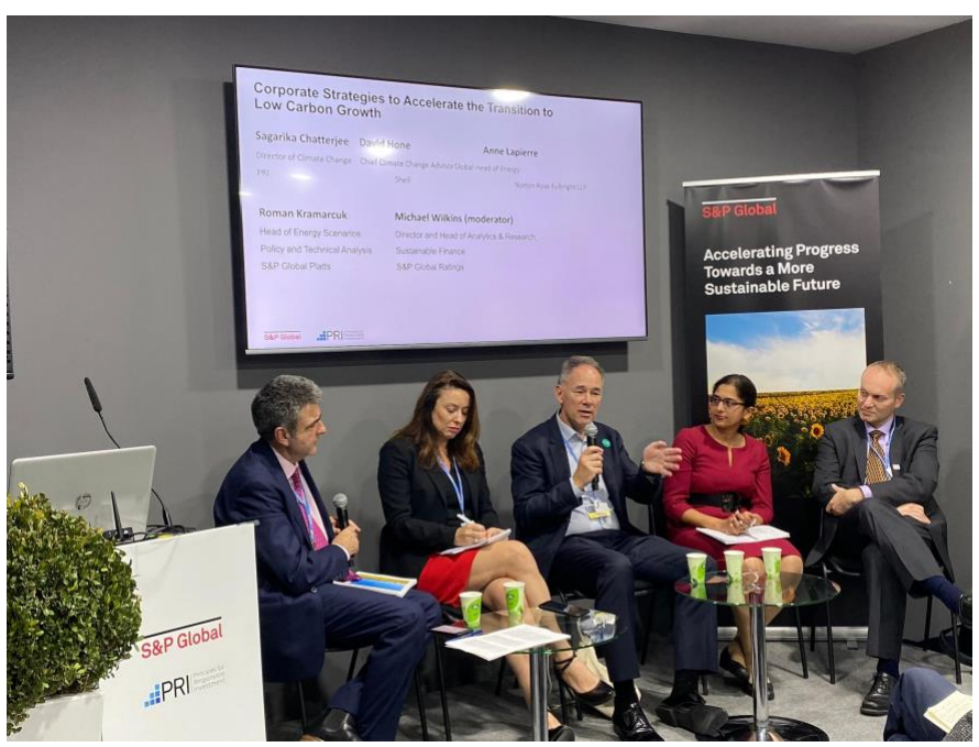
IETA Hub Partners S&P hosted a very well-attended session on how responsible investment can accelerate the low-carbon transition.

Other topics discussed at the IETA Hub included: markets and the low-carbon transition in Mediterranean countries; the impact of carbon pricing on competitiveness; monitoring, reporting and verification; emission reductions from nitric acid production; how business and investors can respond to climate risk; reducing methane emissions in Canada; abatement projects in Asia, and the role of voluntary markets.