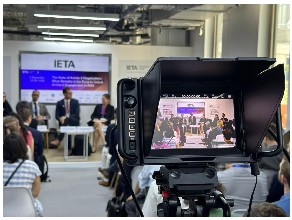
A packed side event room and an eager on-line audience for our traditional update on the progress of Article 6 negotiations.

This brings us to the elephant in the room, this year's IETA session on Article 6, themed "The State of Article 6 Negotiations: Unlocking Engagement in 2024".