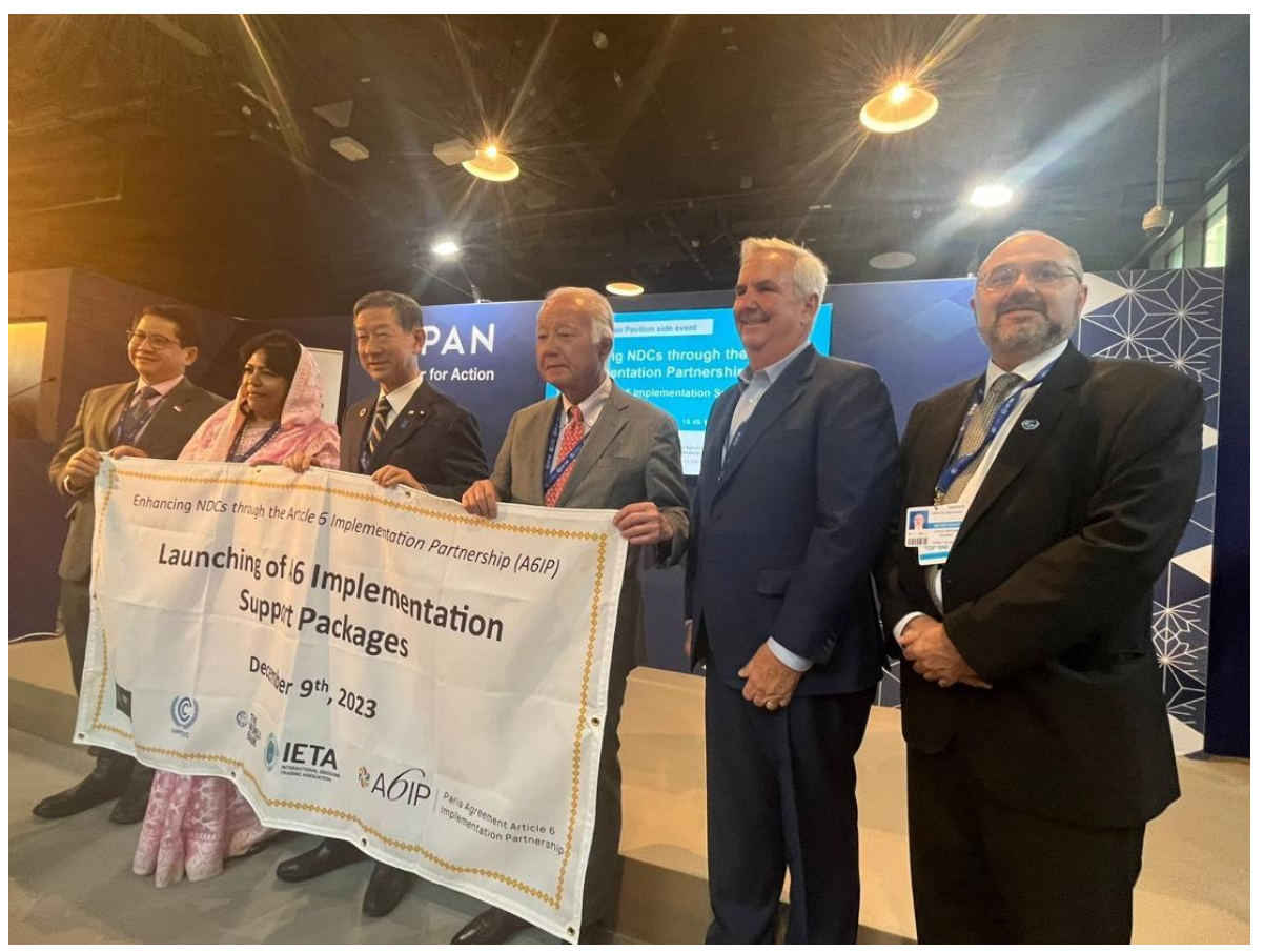
After launching the Article 6 Implementation Partnership in Glasgow, IETA was pleased to participate in the launch of the first implementation support packages in Dubai.

He emphasised the need for businesses to access abatement opportunities globally to achieve net-zero goals, notably in Africa, where significant opportunities exist and should be unlocked with proper financial and regulatory signals.