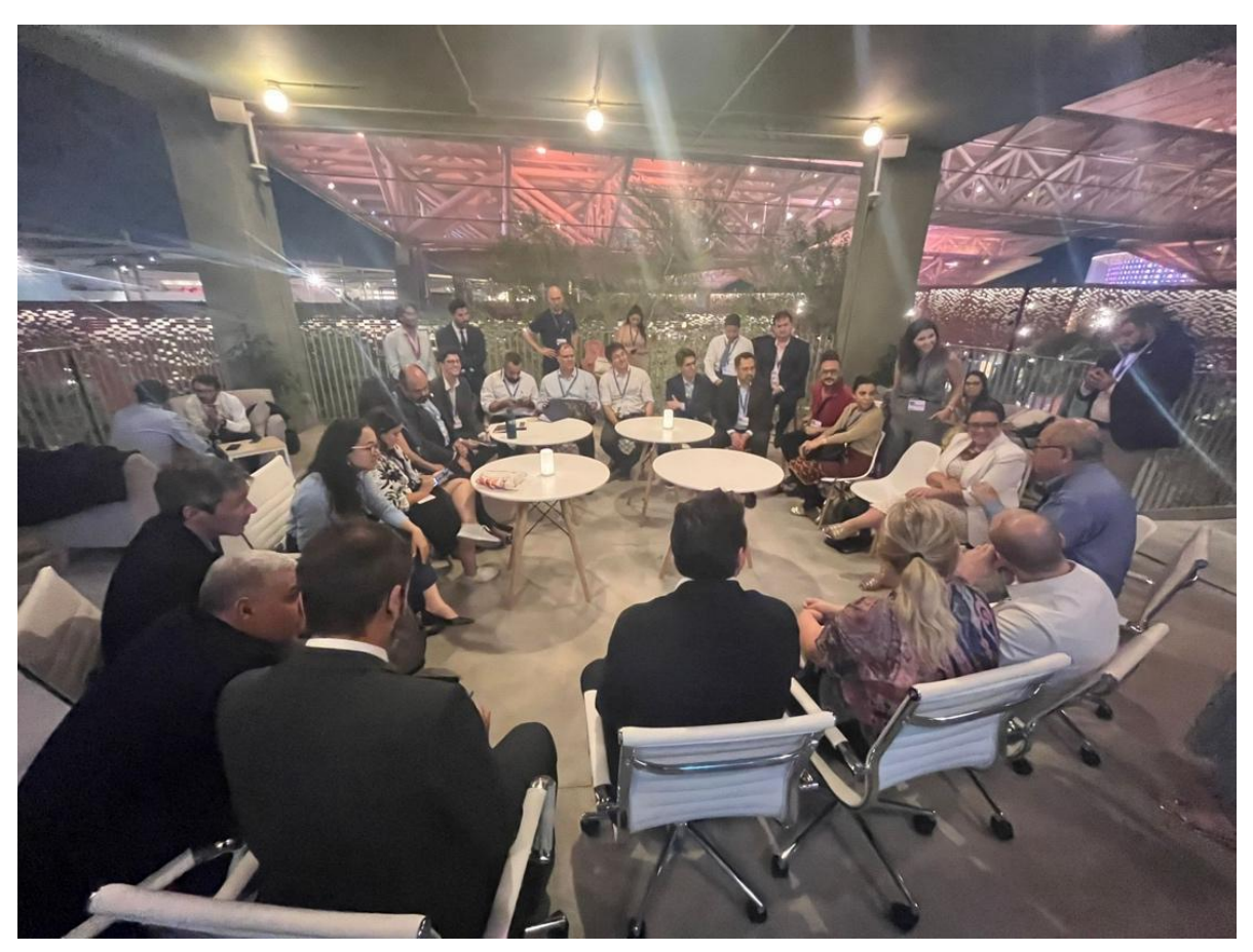
In addition to the social lounge and the side event room, IETA's Business Hub terrace also became the venue for important meetings, such as this Article 6 discussion group.