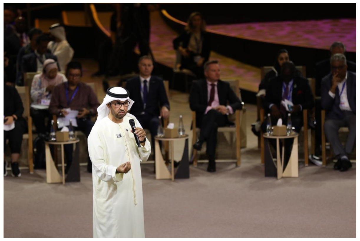
At the Changemakers' Majlis on Sunday December 10, COP President Al-Jaber exhorted leaders and heads of delegation to bridge the divides on the Stocktake text

More than 100 countries including the U.S. had joined the Coalition pressing for phase-out language, but the Arab Group repeated the controversial claim from the first week that "science does not predict or project any phase-out of fossil fuels, or zero fossil fuels in 2050, in a world where global temperature rise is kept to within 1.5 degrees."