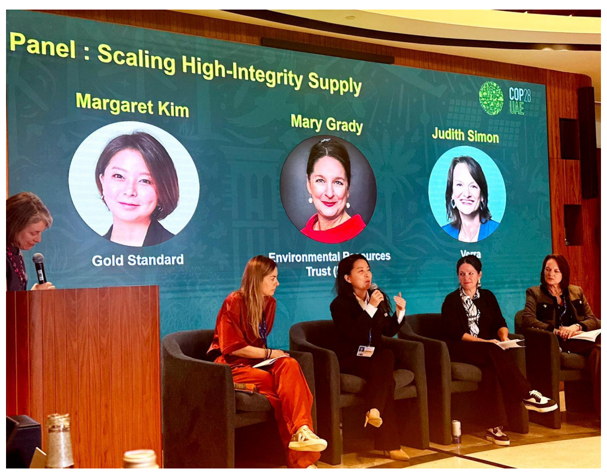
Leaders of the biggest independent crediting programmes spoke at an event to announce their new "integrity collaboration"

One of the highest-profile events at COP gathered six (6) of the world's leading independent crediting programmes to announce formation of a first-of-its-kind "integrity collaboration". The programmes include ACR, Architecture for REDD+ Transactions, Climate Action Reserve, Global Carbon Council, Gold Standard and Verra. IETA facilitated this process and will continue to support the collaboration's work and expansion through 2024.