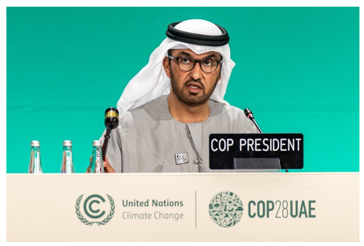
COP28 President, Sultan Al-Jaber of UAE

Sultan Al-Jaber, who was elected President of COP at the first plenary, is also the CEO of ADNOC and the minister of industry of the United Arab Emirates. Unsurprisingly, environmental groups were not inclined to trust that a representative of an oil company and a minister of an OPEC member state would send the right messages to negotiators or indeed to the watching world.