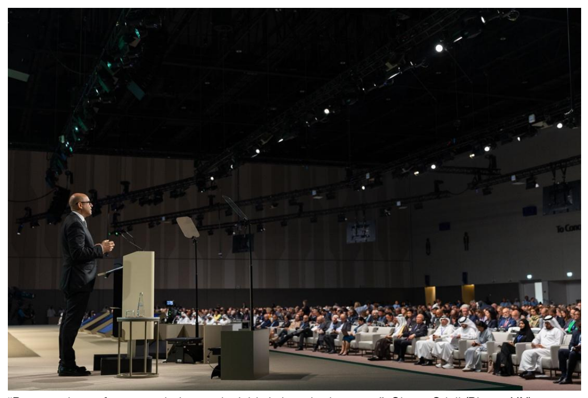
"Progress is not fast enough, but undeniably is it gathering pace": Simon Stiell

"The Global Stocktake shows us progress is not fast enough, but undeniably it is gathering pace. The political and economic logic is increasingly insurmountable," he concluded.