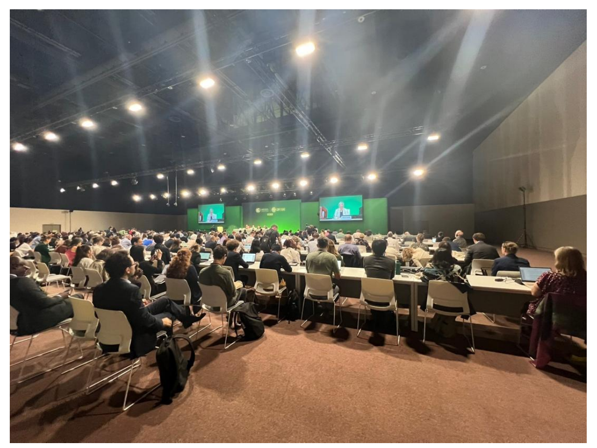
Article 6 negotiations

Mexico, not an active Party in the negotiation for several years, surprised many by taking the floor and rejecting both the 6.2 and 6.4 decisions on the grounds of insufficient human rights safeguards.