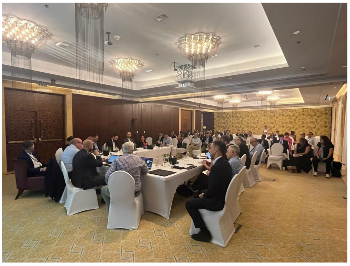
IETA's annual general meeting